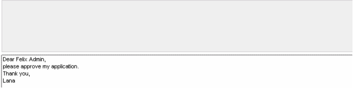
Figure 21: Selection of Admission Administrator

Please be aware that every involved person in this process can see all inserted comments. Comment: