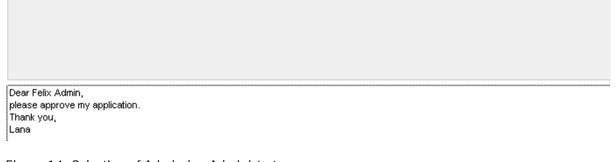
Figure 14: Selection of Admission Administrator

Please be aware that every involved person in this process can see all inserted comments. Comment: