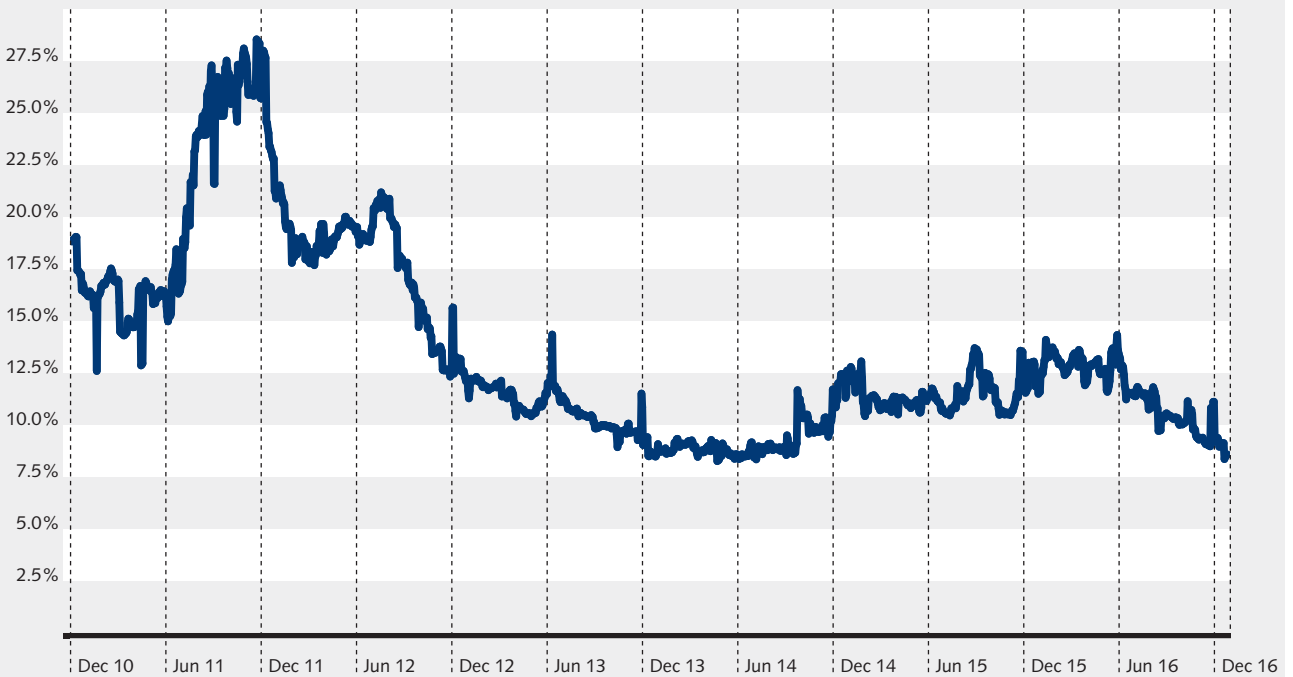
Figure 3 – OEXD dividend volatility 2-year rolling index (volatility level in percent)

In summary, we constructed dividend volatility indexes extracted from the OEXD settlement prices. The VSTOXX® methodology was applied and both a two year rolling index as well as sub-indexes were constructed. Each sub-index corresponds to the volatility of one of the annual OEXD maturities. The pull-to-par effect for dividend derivatives is visible through the decay towards zero of sub-indexes as they get closer to expiration. Unlike for the VSTOXX®